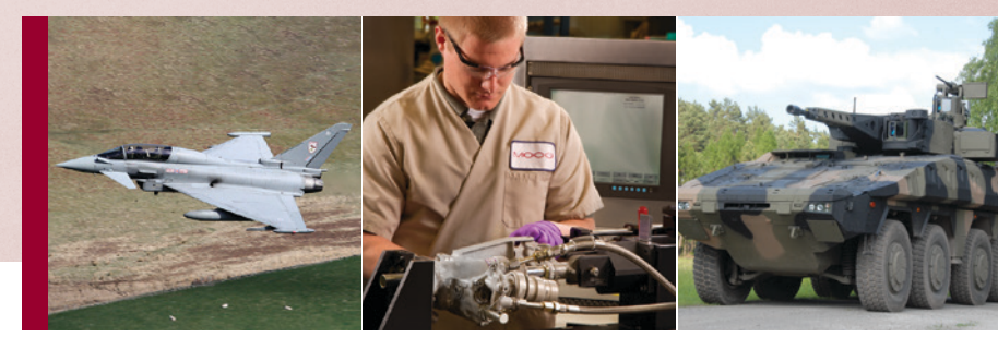
DEFENCE AND AEROSPACE CAPABILITIES