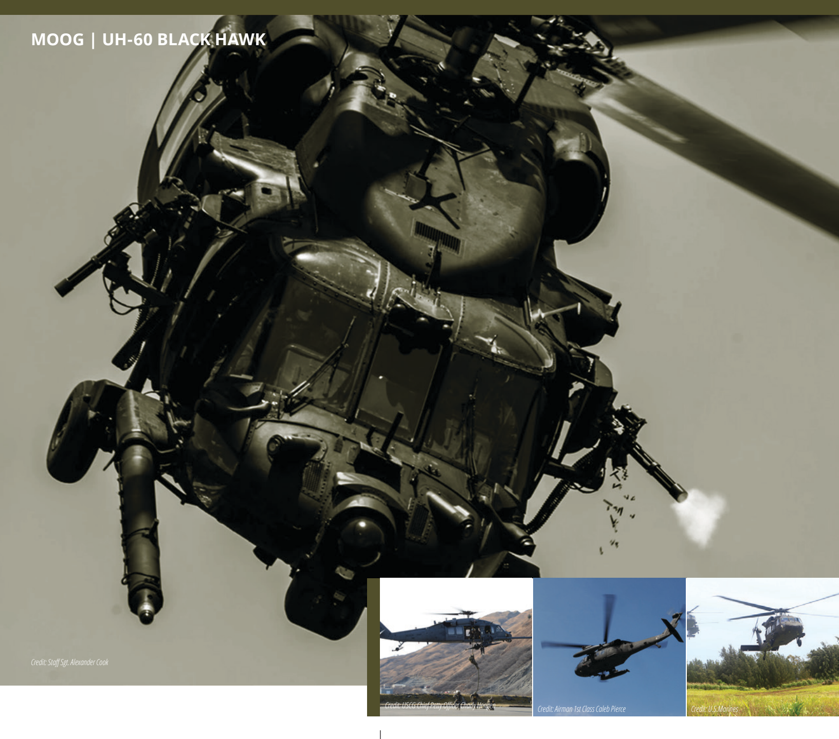
UH-60 BLACK HAWK PRODUCTS AND SUPPORT GUIDE