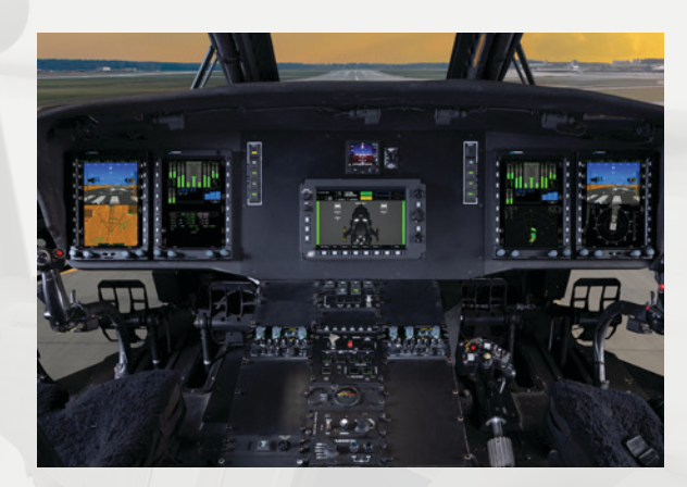
LEARN MORE ABOUT AVIONICS: